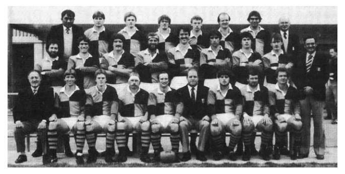
NZ Harlequins Rugby Team 1983