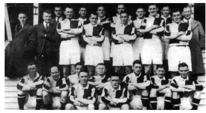
NZ Harlequins Rugby Team 1939

Annual matches with NZ Area Schools and the NZ Vikings Club from Northland have become regular features. A NZ Harlequin camp, backed by the NZ Rugby Foundation and supported by the Waikato Rugby Union for approx 40-45 players, is staged at St Paul's Collegiate annually.