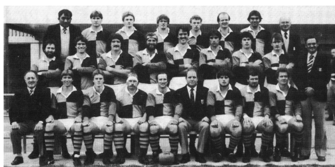
NZ Harlequins Rugby Team 1983