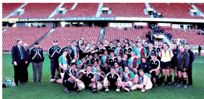
NZ Harlequins Rugby U17 Team versus NZ Area schools 2010