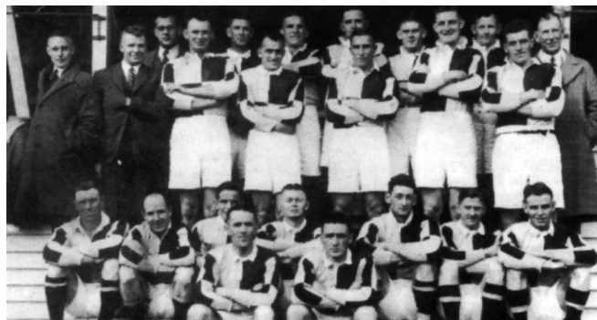
NZ Harlequins Rugby Team 1939

Annual matches with NZ Area Schools and the NZ Vikings Club from Northland have become regular features. A NZ Harlequin camp, backed by the NZ Rugby Foundation and supported by the Waikato Rugby Union for approx 40-45 players, is staged at St Paul's Collegiate annually.