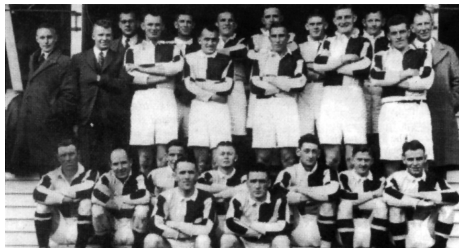
NZ Harlequins Rugby Team 1939

Annual matches with NZ Area Schools and the NZ Vikings Club from Northland have become regular features. A NZ Harlequin camp, backed by the NZ Rugby Foundation and supported by the Waikato Rugby Union for approx 40-45 players, is staged at St Paul's Collegiate annually.