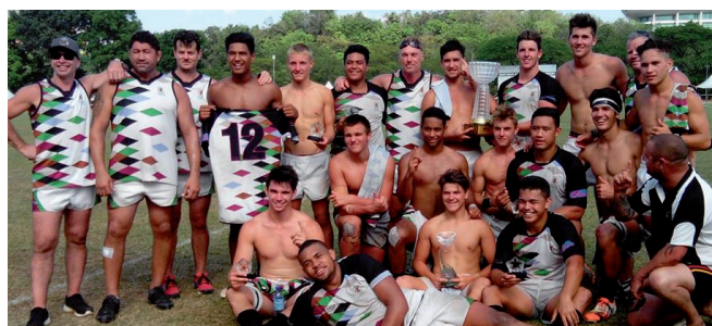
NZ Harlequins Under 18 team, winners of the Kuala Lumpur 10s