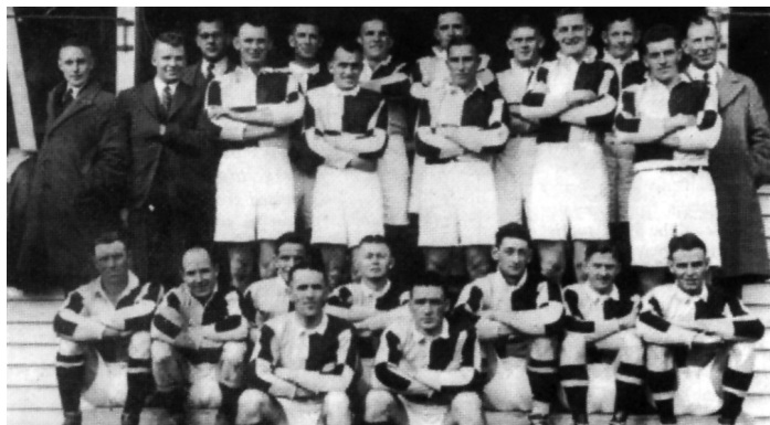
NZ Harlequins Rugby Team 1939

Many All Blacks have played in the New Zealand Harlequin's jersey over the years and since the inclusion of the under 17 development programme in 1992, has given a clear development pathway for young up and coming Waikato rugby players.