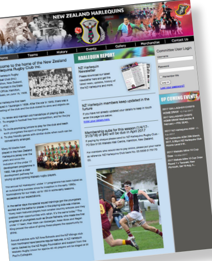
The NZ Harlequins website has all of our clubs history, photo galleries and coming events got to: www.nzharlequins.co.nz

Last season, Waikato Rugby Union published a weekly highlights video of club rugby tries which some weeks went 'viral', reaching millions of people worldwide.