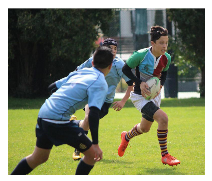
NZ Harlequins Rugby Club - PO Box 9195 Waikato Mail Centre, Hamilton, New Zealand.